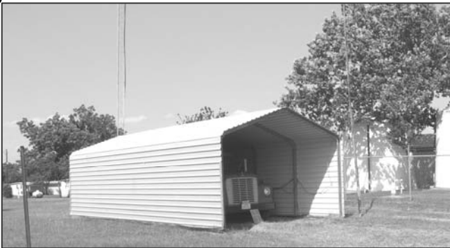
Firefighters living near MVFD's Cistern station can reduce response time by at least 10 min. with access to local equipment.

At a "town hall" meeting on June 26 th , hosted by the Sts. Cyril & Methodius Catholic Church and Cistern community members, Muldoon VFD representatives presented firefighters' current needs for improvement of MVFD's Cistern station facilities (shown above).