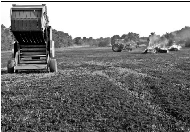
Smoldering hay bales burst into flames after being relocated, to prevent delayed fire activity along the fire perimeter.

Prior to the burn ban, a controlled brush pile fire spread out of landowner's control (mowed grasses fueled spread of fire) and threatened onsite oil field operations and nearby storage tanks. After landowner called for assistance, he supported their efforts by plowing a fire barrier between the burning field and the oil equipment, preventing more serious problems from developing.