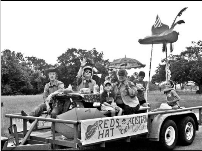
Red Hat Society of Cistern was well represented!

We had a great time again this year, with very active participation in the parade. For more photos, visit MVFD website at http://www.muldoonfiredept.org Next year, we may be featuring YOU, so plan to join us in 2009!