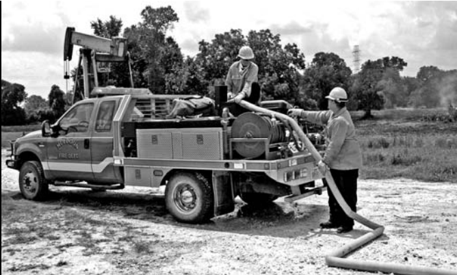
Firefighters Jerry Haddox and Martin Spoelstra work the hose.

Prior to the burn ban, a controlled brush pile fire spread out of landowner's control (mowed grasses fueled spread of fire) and threatened onsite oil field operations and nearby storage tanks. After landowner called for assistance, he supported their efforts by plowing a fire barrier between the burning field and the oil equipment, preventing more serious problems from developing.